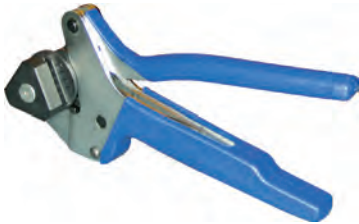
rear view showing incorporated turret head positioner

CXPZ TP is a simple but effective "square shaping" manual crimping tool incorporating discrete (3-size nests) crimping dies and turret positioner for relevant crimp contacts sizes ranging from size 1.5 to size 6.0. Size 10 requires CCPZ RN (Rennsteig PEW 8.75 universal manual crimp tool) or CXPZP D (Daniels WA27-309-EP pneumatic tool) For series CX (40A) contacts (and their corresponding HNM variants series RX) manual crimping tool CXPZ D (Daniels M309) up to size 6.0 or CCPZ RN (Rennsteig PEW 8.75) for all sizes – or the pneumatic CXPZP D for large volumes of crimps, by providing 8-indent crimping, are recommended for highly demanding applications, such as in transportation.