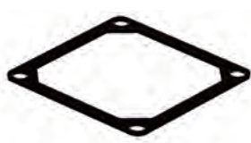
CR 10 MO gasket

Following flange versions available on request: 73 x 73, 78 x 78, 80 x 80, 98 x 98 mm