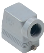
Hoods (from page 395)

The enclosures ensure IP65 degree of protection when mated and locked with the closing lever.