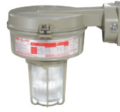
Wall w/ 5-1/2" Refractor & Guard