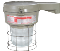
Stanchion Straight w/ 7-3/4" Refractor & Guard