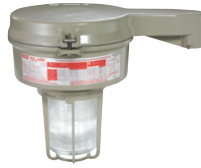
Stanchion Straight w/ 5-1/2" Refractor & Guard