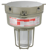
Ceiling w/ 5-1/2" Globe & Guard