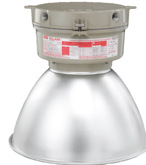
Ceiling w/ Enclosed Reflector