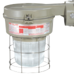
Wall w/ 7-3/4" Refractor & Guard