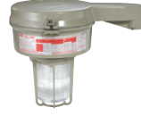
Stanchion Straight w/ 5-1/2" Refractor & Guard