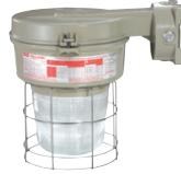
Wall w/ 7-3/4" Refractor & Guard