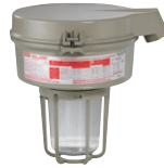
Stanchion 25° w/ 5-1/2" Globe & Guard