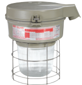
Stanchion 25° w/ 7-3/4" Globe & Guard