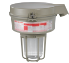
Stanchion 25° w/ 5-1/2" Globe & Guard