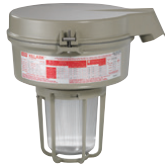
Stanchion 25° w/ 5-1/2" Globe & Guard