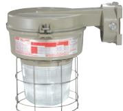
Wall w/ 7-3/4" Refractor & Guard