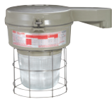
Stanchion Straight w/ 7-3/4" Refractor & Guard