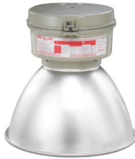
Pendant w/ Enclosed Reflector

Class I, Div. 2, Groups A,B,C,D ① Class I, Zone 2, Groups IIC, IIB, IIA Class II, Div. 1 & 2, Groups E,F,G Class III