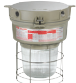
Ceiling w/ 7-3/4" Globe & Guard