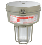
Pendant w/ 5-1/2" Globe & Guard