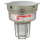
Ceiling w/ 5-1/2" Globe & Guard