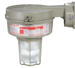
Wall w/ 5-1/2" Refractor & Guard