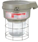
Stanchion 25° w/ 7-3/4" Globe & Guard