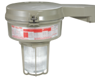
Stanchion Straight w/ 5-1/2" Refractor & Guard