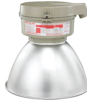
Stanchion 25° w/ Enclosed Reflector